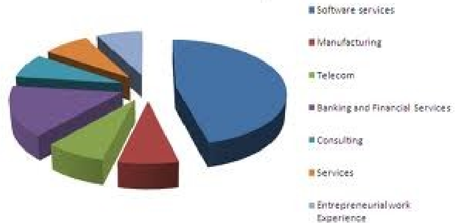
Previous work experience

More than anything, I have learned that what is good for the company is also good for me. So, I listen very carefully to directions and always keep my superiors informed of my actions.