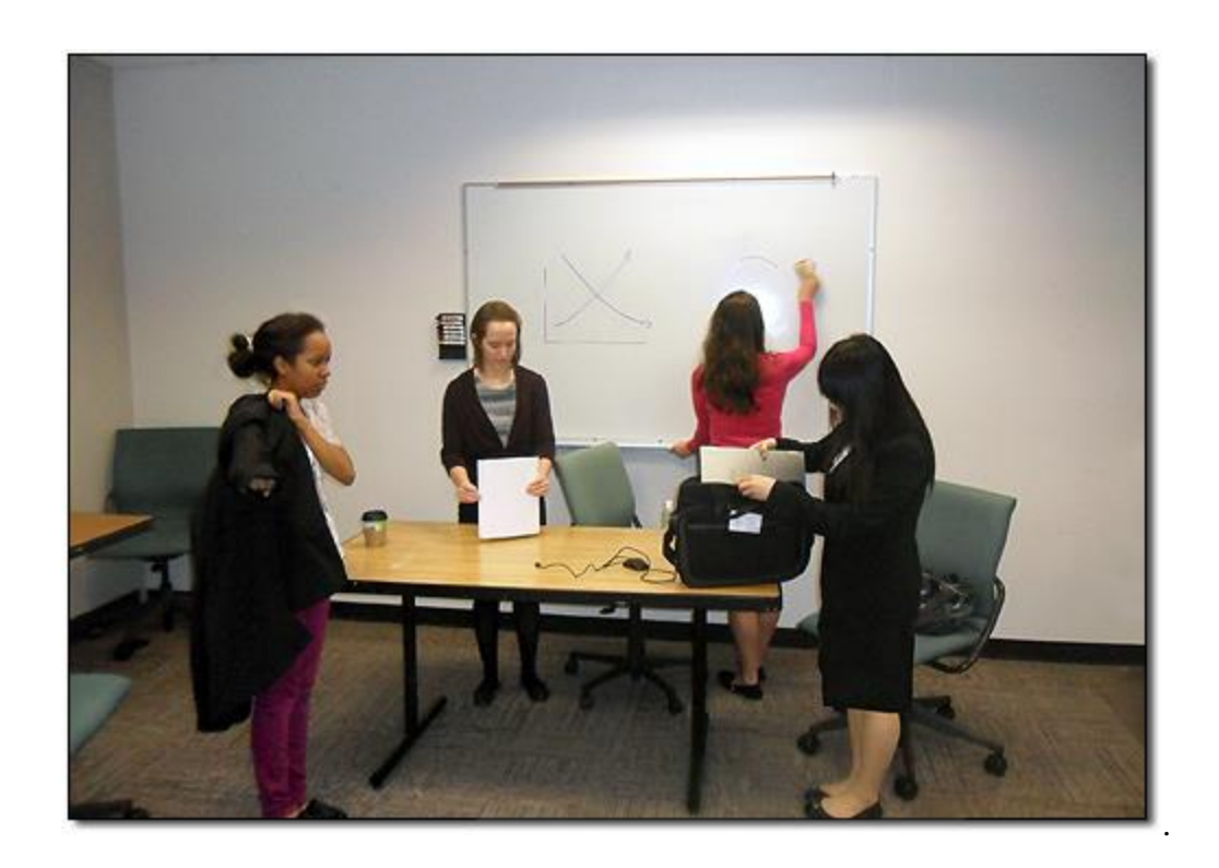
Step 1. Make a rough guess on what the picture is about. (the main object or focus of the picture)

Step 2. Start describing from the background to the foreground, and from the left hand side to the right.